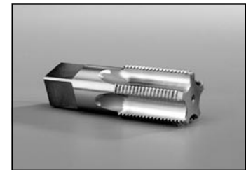
Fig. S85 — BSPP Straight Thread Tapping Tool