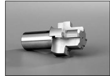
Fig. S84 — BSPP Straight Thread Port Counterboring Tool